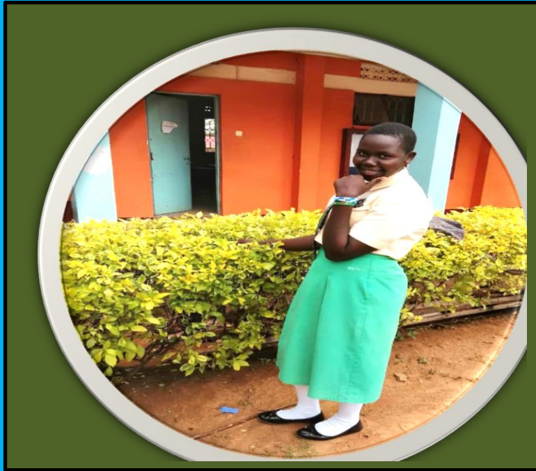
image of St. Mary's Girls' Secondary School, Madera. Before the construction of the main hall. Students used pray in the assembly ground

extend my sincere gratitude to the donors for our magnificent main hall that has changed the face and the